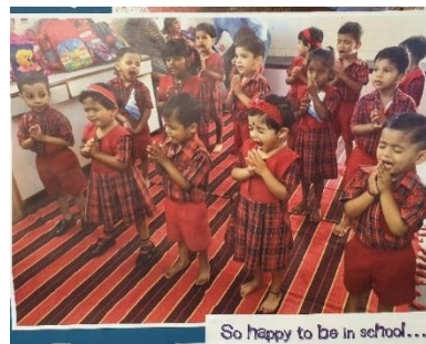
So happy to be in school...

We will be giving the children their calendars on Monday 23 November. If you would like to make a donation to support the Jyoti Kendra nursery in Mumbai, we would be very grateful. There will be collections boxes in each