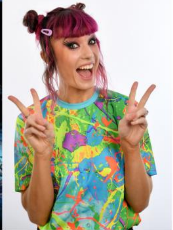
BECC HILL - HORROR HEIGHTS: DEAD RINGER

JOIN AWARD-WINNING PERFORMER AND WRITER AND CITY PERSONALITY BEC HILL FOR A FREE CREEPTASTIC EVENT BASED ON HER SPOOKY BOOK SERIES HORROR HEIGHTS